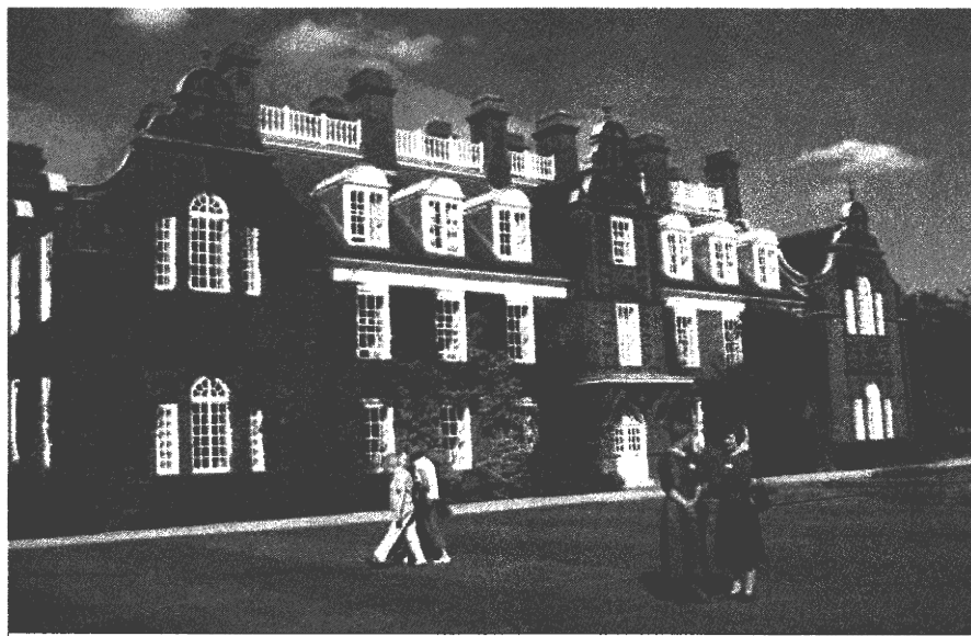
ESA Leadership Conference, Cambridge 14-16 September 2007: delegates enjoying the grounds of Newnham College and the beautiful late summer weather

Notes from a number of the presentations, including some of the more practical aspects or organisation, are still available (by e-mail) from the ESA office. Please get in touch if you are interested in further details.