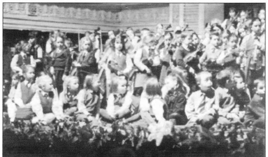
Junior violin students waiting to perform at the Cork School of Music 30 th Annual Suzuki Concert, November 2002